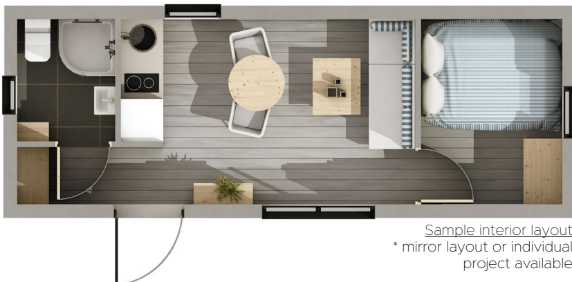
Sample interior layout * mirror layout or individual project available

Meveline homes are fantastic alternatives to wooden and traditional homes. The homes are delivered pre-built and placed directly on the ground without a foundation. Because of the attachable wheels, they can be positioned anywhere. The home's mobility has a huge impact on the use as a temporary structure. Additionally, after placing the home at its permanent location you can mask the mobility function and aesthetically integrate it into the environment.